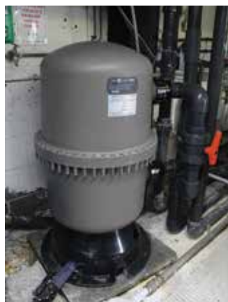
The MultiCyclone 70XL is a centrifugal filtration device that has been specially created to handle high water flow for commercial sized pools.