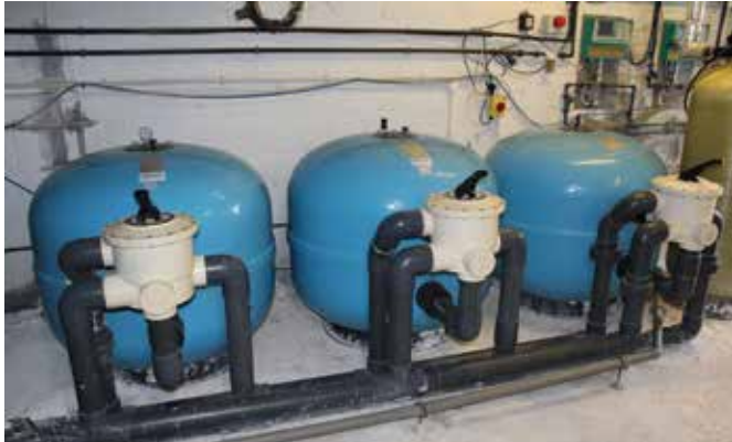
3 x Lacron 42" LSC commercial filters has been installed for the 220m 3 swimming pool.