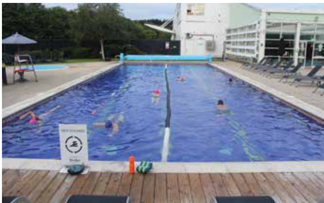
Waterco’s Glass Pearls are manufactured from 100% pure glass and offer much finer filtration than conventional filter media. The superb clarity has been recognised by David Lloyd’s staff and their swimming members.