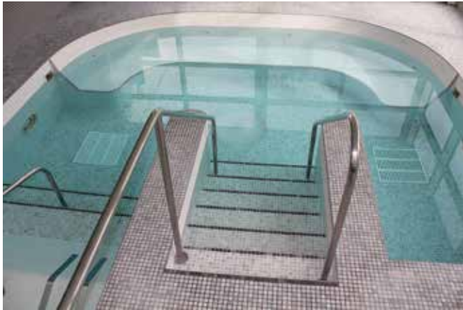
DLL’s Southampton, West End facility provides high-end, family-orientated amenities including a fully tiled 220m 3 outdoor swimming pool and 9m 3 therapeutic spa.

To ensure high quality pool and spa water for members, David Lloyd, West End asked Adam Tredwell at Tad Worx and Steve Martin at Paramount Pool Products to supply and install Waterco’s MultiCyclone filters and Glass Pearl filter media. This choice was determined after extensive market research confirmed this system not only produced crystal clear water, but also had Climate Care Certification credentials.