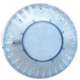
Zane Gulfpanels are precision injection-moulded from a high-trade formulated polymer, which was selected for its outstanding heat transfer properties and its exceptional durability

"With the high efficiency of the Waterco products, it has been a cost saving benefit with the low power energy use due to the efficiency of the plant room," he says. "Coupled with the purer water due to the superior sanitation and filtration, the water can still be used onsite during any backwash process to water the garden that is less strain upon any water resources."