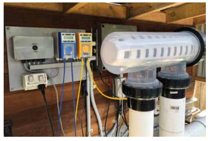
The Oxi Swim Sanitiser Cell combines the use of electrolysis with hydrogen peroxide to form a bacterial killing weapon.