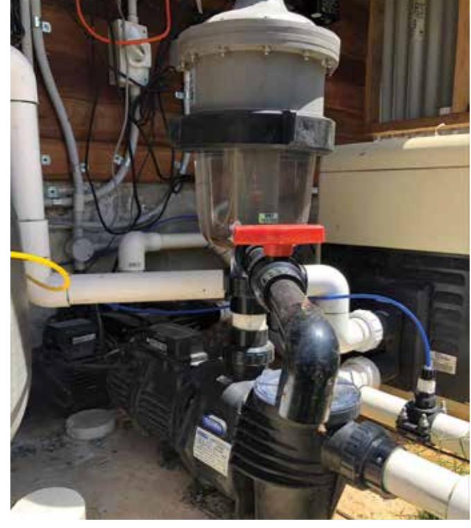
The MultiCyclone unit also only disperses 15 litres of water when flushing its cleaning cycle.

"All of this ensured the filtration system ticked every box from a sustainability point of view and made the entire system extremely efficient," he says.