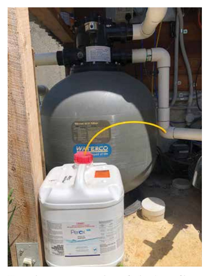
Water and oxygen are necessary elements for the existence of human life. Therefore, it seems only natural to use hydrogen peroxide to keep your swimming pool and spa naturally clean.

A revolutionary breakthrough in water treatment technology, the Oxi Swim Sanitiser Cell combines the use of electrolysis with hydrogen peroxide to form a bacterial killing weapon. The combined power of two sanitisers provides an oxygen rich swimming environment that is extremely efficient in neutralising pathogens. It's a dual system, which means you can flip the system in winter to a low salt chlorinated pool.