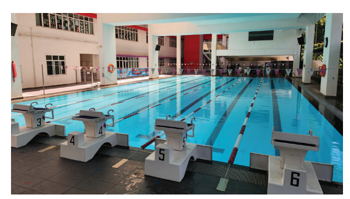
Diagonal angle view of the indoor six-lane swimming pool