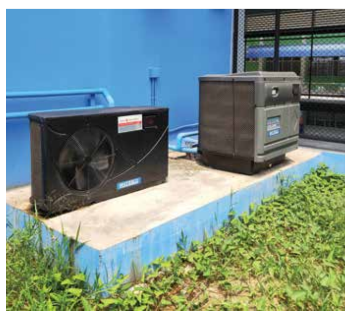
The Eletroheat MKIV 9 kW (L) and Electroheat Plus MKIII 37 kW (R)

"With products that maintain a desired water temperature in the pool, it allows the children to exercise happily and develop their potential continuously. Therefore, we are confident in choosing WATERCO's products that are diverse and meets the demand"