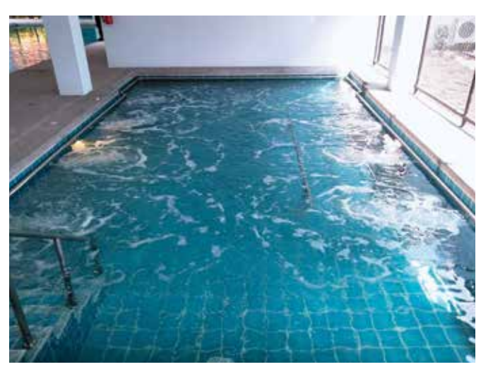
Waterco's Electroheat solution ensures the water temperature remains at a comfortable 37 ^{\circ}\mathrm{C}