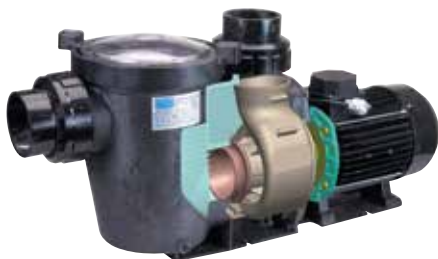
The Hydrostar MKIII's internal volute hydraulic design provides a natural balanced water flow and reduces hydraulic turbulence