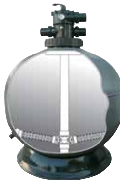
Micron vertical commercial filters are equipped with "Fish-bone" hydraulically balanced laterals, to improve its filtration and backwashing hydraulic efficiency