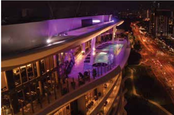
The 36m x 9m infinity pool is perched 67 metres above ground and extends five metres beyond the side of the multi-storey tower