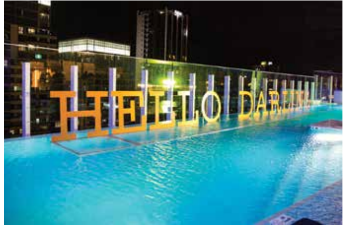
'The Darling' at The Star, which received the prestigious SPASA National Gold Award for Commercial Projects.

Designed and constructed by multi-award-winning Surfside Pools Commercial, the 36m x 9m infinity pool relies on Waterco to maintain premium water quality for guests staying at 'The Darling' at The Star Gold Coast.