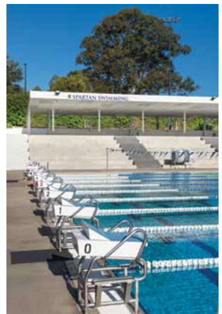
Somerset College, 50-metre Olympic sized swimming pool. ▶