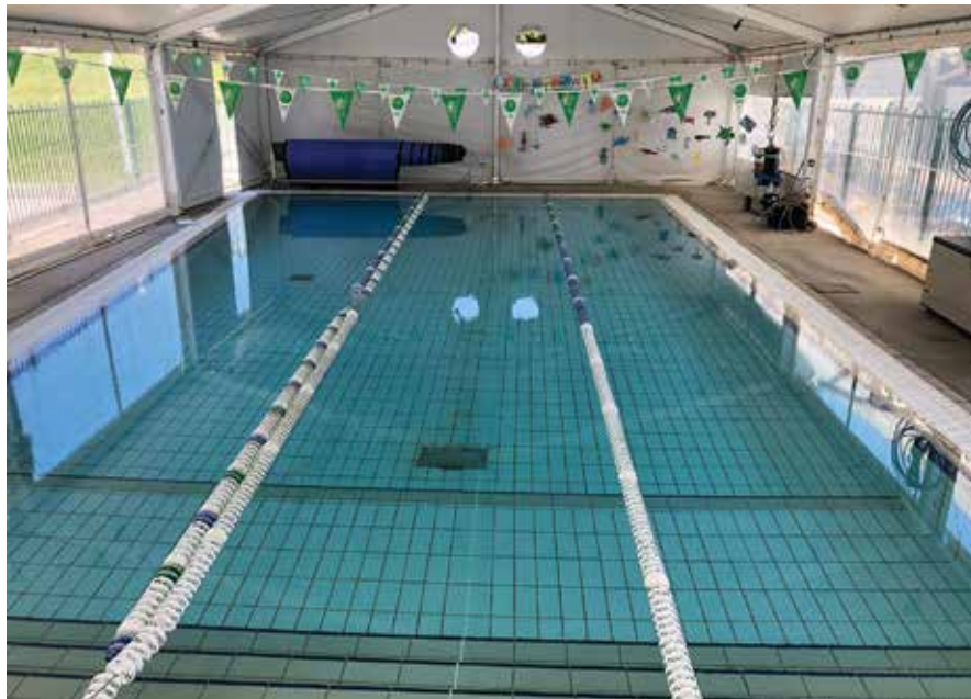
Somerset College's 100,000 litre indoor Hydroxypure pool.

"I came across Hydroxypure while researching an alternative to chloramine management, and in July 2017 we began trialling the system in our 100,000-litre indoor pool," explains Forrest. "We fully drained the pool, changed our media then filled it up again - literally out with the old and in with the new."