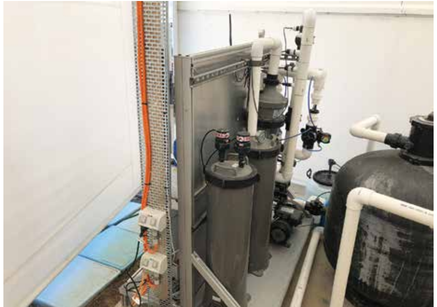
Somerset College's Hydroxypure commercial system.