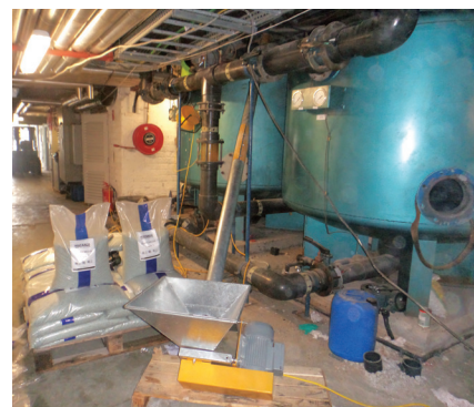
30 tonnes of Waterco EcoPure Glass Media replaced the sand filter media in five steel fabricated filters.